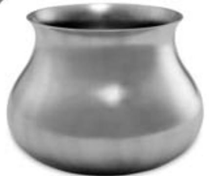
Centerpiece Vase $45