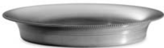
Wine Coaster $50