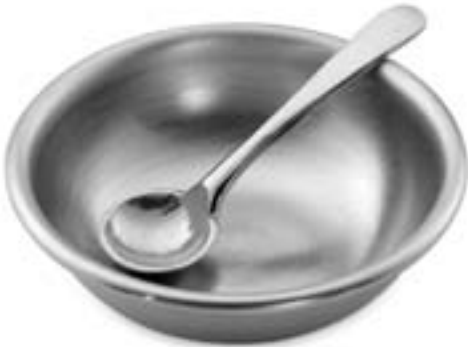
Salt & Spoon $25