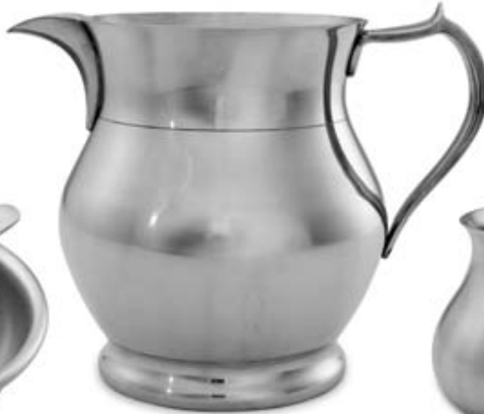
Dunham 2 Qt. Pitcher $210