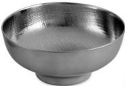
Wood Grain Nut Bowl $45