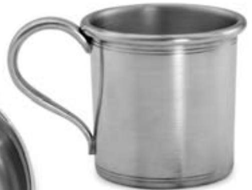
Baby Cup (straight sides) $40