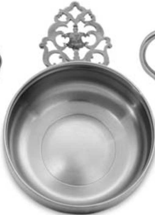
Small Jones Porringer $50