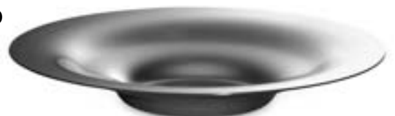
Fruit Bowl (MFA, Boston) $185